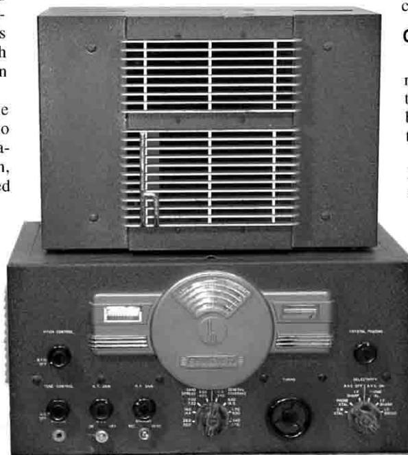
The Hallicrafters SX-23 receiver.

This is just one portion of the SX-23 advertising blitz that consumed 10 pages in QST .