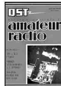
The "birth" of the SX-23 was announced in the March 1939 QST .